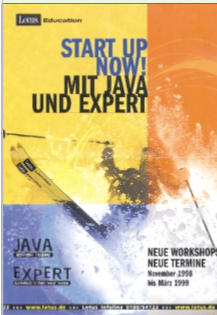
Motiv-Serie für Anzeigen und Flyer